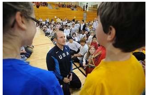
Olympic gold medal speedskater Casey FitzRandolph talks with students during Wednesday's presentation.