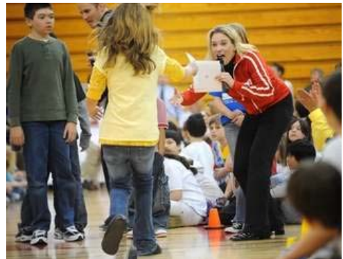
Former Olympian and University of Wisconsin track legend Suzy Favor Hamilton officiates a relay race Wednesday at Riverside Elementary School.

"The wonderful thing about track is it's for everybody. ... Track and field has the most participants of any sport in high school."